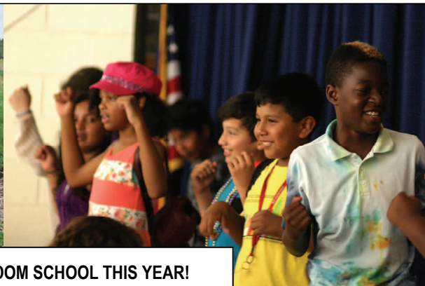
THANK YOU TO EVERYONE WHO HELPED WITH FREEDOM SCHOOL THIS YEAR!